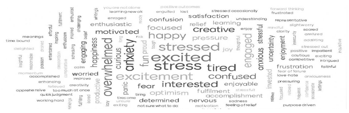
Figure 3. Q4 Word map of feelings from one of the study HEIs

The quantitative data from Q5-Q8 provided limited basis for analysis and insight. The averages of the tutor responses (n=22) on the 5 point Likert scale broadly matched the overall student results, however individual responses also included tutors marking all questions at both the low and high end of the scale, suggesting highly individual views on the topics. The student responses across all 4 years and 3 HEIs were broadly in line, with some indication that 4<sup>th</sup> year students were more reflective and objective in their answers than lower years. There was a common profile of scores across year groups and the four questions. Q5 Goal setting had the highest ratings with >70% scoring in the 4-5 range. Q6 Project structuring scored lower with the majority >66% scoring in the 3-4 range. Scores shifted lower again for both Q7 Recording-reviewing-reflecting and Q8 Decomposition & sensemaking with a wider spread of results and a smaller majority, around 40% scoring at the midpoint of 3.