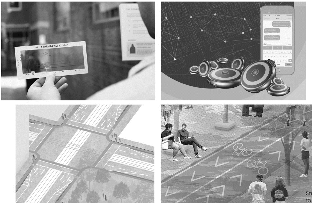
Figure 1. Safe City Smart City project design proposals (clockwise from top left: the ‘ How to be Considerate ’ campaign, Eystre wearable safeness technology, urban redesign to separate pedestrians and cyclists, new inner city cycle route planning and navigation)