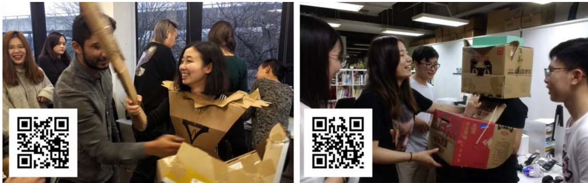
Figure 2. Left - fighting robots under construction at Coventry University. This particular 'robot' had been, until now, one of the cohort's quieter students ( https://youtu.be/AHhUMilBg14 ). Right – Designing a device for converting smells to colour at Tongji University ( https://youtu.be/LbT67YKkEHI )

of an hour, three cardboard fighting robots emerged. In terms of design process, in no case did there appear to be an initial concept generation phase or adherence to some centrally orchestrated vision. Rather, the fighting robots appeared to evolve organically in a tightly collaborative operation that relied on direct interaction with the materials and ongoing reassurance and suggestion. Tasks were delegated or volunteered. All of the groups had decided that the strategy was to dress a student as robot and equip her [all three robots were female] with some fairly savage hand-held weaponry (Figure 2, left). Fascinatingly, two of the three students who volunteered to be the robots were Chinese and both of them were among those who had hitherto been among the most introverted of the cohort. Yet here they were, laughing, shouting and when the presentation time came, enthusiastically 'fighting' other robots in front of their peers and the author. It was as though these were completely different students from their normally quiet counterparts. And to the delight of everyone, at the end of the process, three highly successful fighting robots amiably paraded their fighting capability.