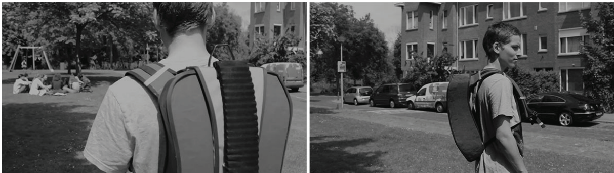
Figure 4. Two stills from the final movie, showing Pat longing to meet other backpacks and her disappointment, after her owner has failed to live up to her desire

Finally, in the fiction phase, a short film was produced that should vividly and convincingly demonstrate the object in use. In the pre-production phase, a detailed storyboard was made and the mock-up was further developed into a ‘film-prop’. The storyboard would show the overall story in separate scenes, list camera angles and zoom-levels, specify human actions and object feedbacks, and further describes the film’s affective and auditory qualities. In the production of the film, a real-world (but accessible) location were selected, lighting conditions were controlled, camera positions chosen and the interaction with actors and puppeteers was rehearsed and performed. Finally, in the post-production phase, the precise interaction flow between the user and the object was further detailed to create a convincing speculative design. Much attention was being paid to the design and synchronization of the sounds the object would make when in use, as it was clear from previous experiences that these should be realistic and perfectly timed to be credible. At the end of the course all films were reviewed, followed by a plenary discussion of course’s structure, method and results.