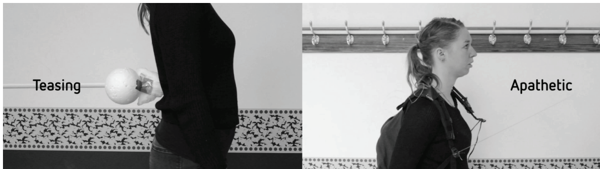
Figure 2. Pat's states were acted out using simple materials and tools, such as foam, tubes and nylon wires. When in the 'Teasing' state Pat would indicate her intentions through a slight nudge in the lower back, while the 'Apathetic' state would be expressed by loosening her shoulder straps, resulting in her sliding from the back of her owner

In this phase+ the concept was further developed by engaging with materials to better articulate what the object looks and sounds like, as well as how it behaves and interacts. As a first step, simple mock-ups of the product are created, informed by the object's functions and personality, to explore its expressiveness, size, overall shape and material composition. Further, the auditory qualities of materials and online sound libraries were explored to determine possible sounds the object might produce. The object's behaviour was then further explored by animating it through human motion (e.g., puppeteering), which involved creating a motion-transfer mechanism to control the object. By aligning this behaviour with human actions (i.e., the user of the product), the interactivity was explored as well (Figure 2). A film was produced to study and show how form, movement and sound come together as coherent expressions. Finally, a more detailed mock-up of the object was made.