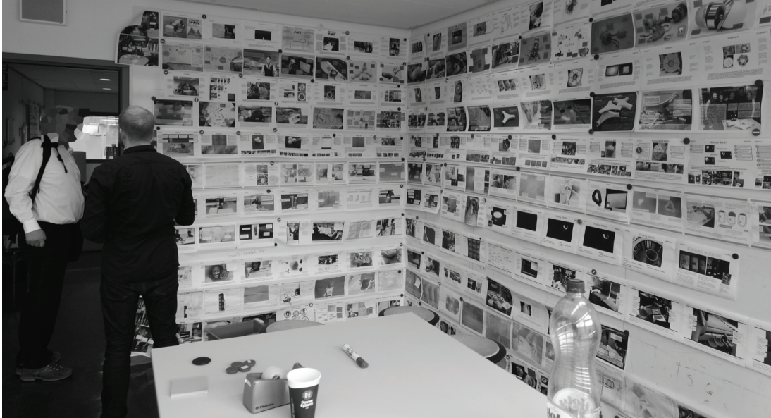
Figure 2. Progress card format enabled design coaches to get an overview of student design processes, compare them to each other and understand design process dynamics throughout the course and after its completion, in a time-efficient manner

“additional task”, which took “time (they) would have preferred to spend on design activities”. None of the teams used progress cards to reflect back on their process, while in retrospect most students agreed that doing this would have benefited their learning process, in one case blaming the design coaches that they didn’t enforce such reflection, only suggested it. Notably, the final version of the progress cards, as featured in figure 1 on the right, has been met with the most positive reception from students to date, with the majority of participating groups reporting to use the format in internal discussions, and not requiring reminders to maintain using the format.