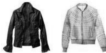
Figure 2. Bio-couture jackets by Suzanne Lee