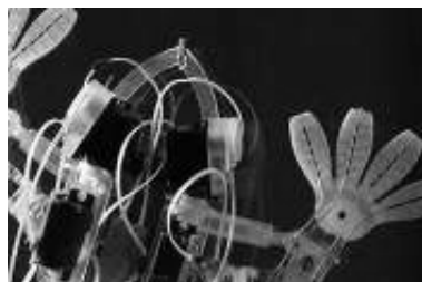
Figure 4. Gecko Robot