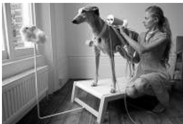
Figure 1. Experimental Example of bio-design entitled 'Life-Support'