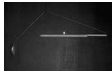
Figure 3. Bioluminescent Ambio Lamp