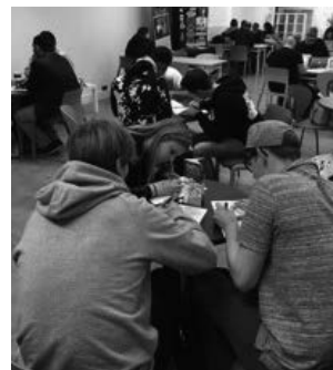
Figure 2. Participants while conducting the experiment in the Heart Space