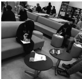
Figure 1. Participants in Group 1 at the Heart Space in CSAD, as First Test Environment

The ‘Heart Space’ in the CSAD building was chosen because it has an informal atmosphere, which gives the participants more flexibility in the way they seat and position. It was also a very busy space at the time the experiment was conducted, as it was 1:30 PM, i.e. lunch break.