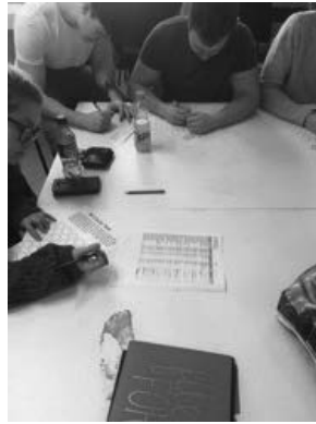
Figure 4. During the test in the Design Studio