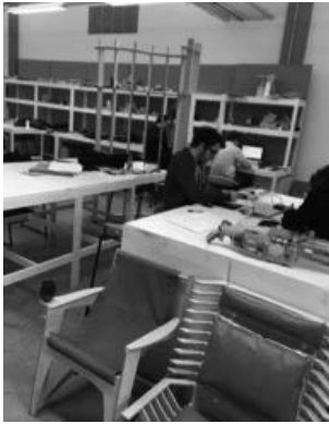
Figure 3. Participants group in the Design Studio