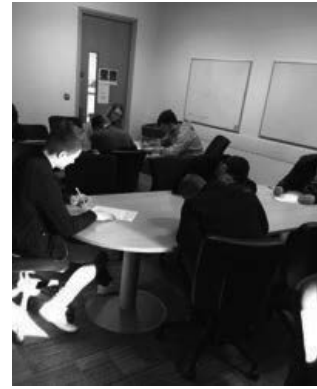
Figure 5. Typical classroom environment