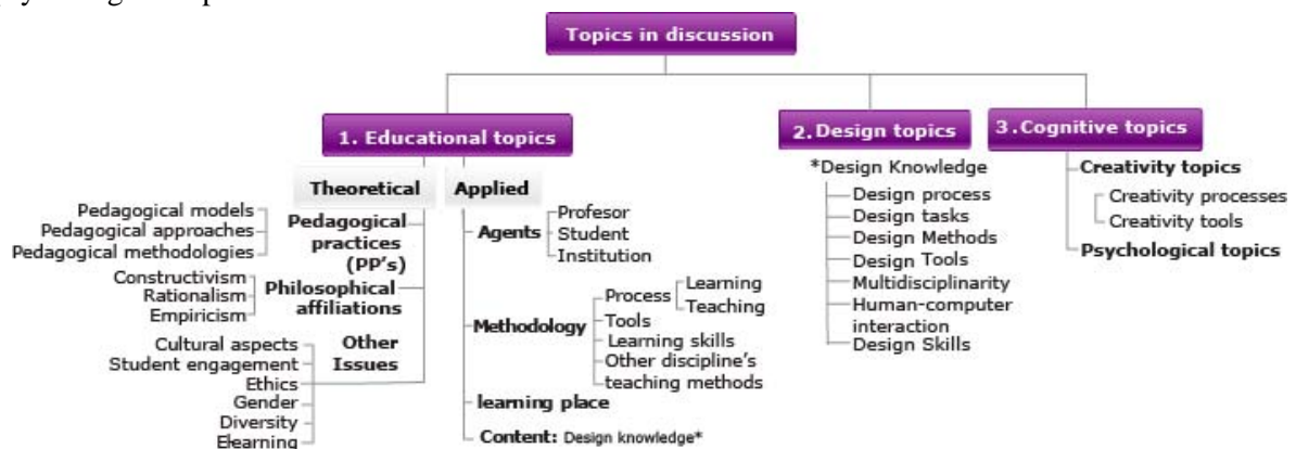
Figure 3. Structure of design educational topics found on literature

The figure 3 is a proposal of a general view of design education context and its PP's. The elements in the reviewed literature are not explicitly connected with the PP's but, with further studies, could be found as important parts of the mentioned model to build in the future. This structure was constructed with the sematic analysis tool of Qiqqa as seen in figure 1. It presents 2 branches of design educational topics. The first, is composed by PP's (M, MT & A), philosophical affiliations (with constructivism as the most mentioned) and other issues (cultural aspects, students' engagement, etc). The second, shows who (agents), how (methodologies), where (learning places) and what (design knowledge: design process, tasks, methods as design for x or UCD methods, design tools, and skills, multidisciplinary aspects and HCI). The third branch shows the cognitive topics comprising: creativity topics and psychological topics.