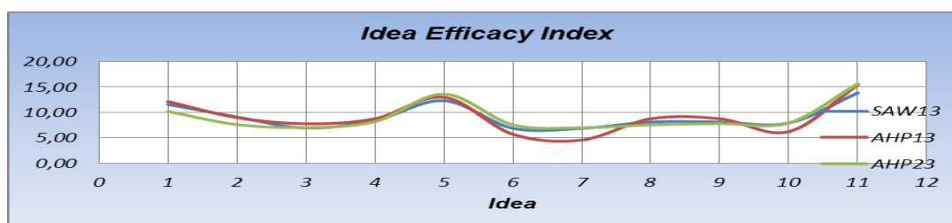
Figure 2. The comparison of the results of the idea Efficacy evaluation

The implementation of the evaluation for the case under consideration, the set of 11 ideas, collected the results of the evaluation of a group of assessors by the SAW method, and the results of the evaluation by two groups of assessors by the AHP method. These results are marked with SAW, AHP1 and AHP2. How the results are correlated was verified by using the Pearson and Spearman coefficient of rank. Calculated correlations are positive and have a value greater than 0.8, which indicates that there is a correlation between the success factors of certain ideas by using the SAW method and application of the AHP method for both groups of assessors and that it is a strong positive correlation. The existence of a strong positive correlation is indicated by the values of efficacy indexes of ideas derived by evaluating the value of the idea (Figure 2.).