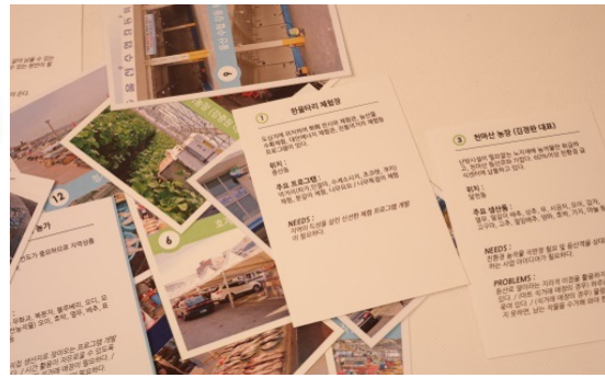
Figure 2. A map of local resources in Ulsan Figure 3. Resource tool-kit for ideation

To design of product-service systems for community enterprises, a co-creative workshop was used. The workshop was held four times over two weeks targeting potential stakeholders of community enterprises and it took three hours each. Participants included producers, consumers, entrepreneurs, and administrators. The management consultants and designers participated in the design process as assistants to support their design activity. They were divided into four teams with management consultants and designers acting as facilitators. Stakeholders were encouraged to excavate ideas based on their needs in the manner of gamification using the toolkit and embodying the business model. In the end, business model concepts, including the service system and process, were developed.