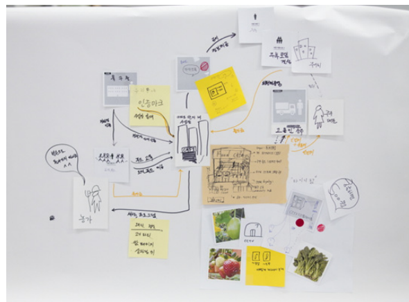
Figure 5. Concept sketch for building a system map

Designers were assigned to each team to facilitate development of ideas into the business models. In addition, they also helped the participants visualise their idea in the form of system map which illustrates the stakeholders and their interactions (Figure 5). In this phase, practical problems, such as channel or competitor, were considered and the concepts creating mutual prosperity became materialized.