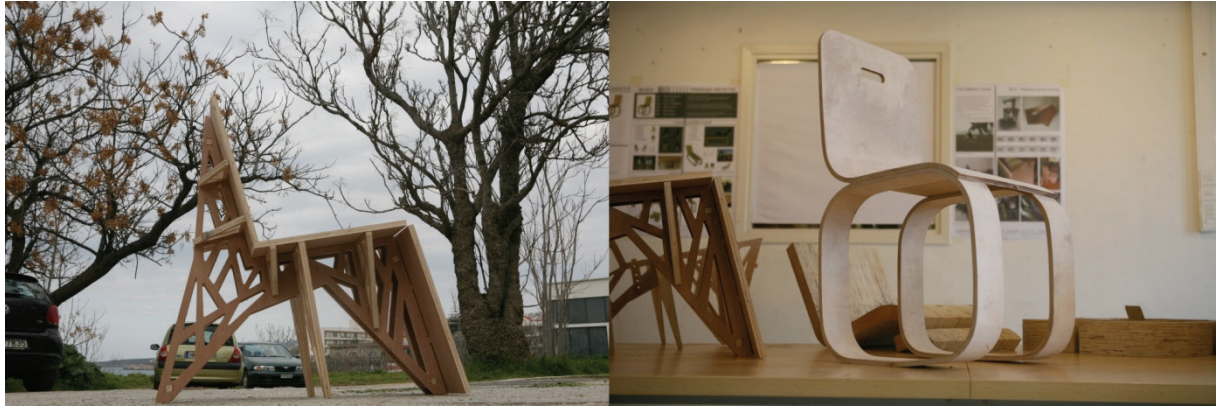
Figure 2. Student projects year 2010-11, prototypes from press fit and steam bent plywood (E.Chronopoulou, G.Gratsou, E.Aslanidou / A.Andredakis, S.Konstandinidis, D.Tzagarakis)

For the year 2012-13, we used composite aluminium panels for the students' designs. Mainly the techniques of folding and rolling were implemented, as shown in the two following examples of chairs.