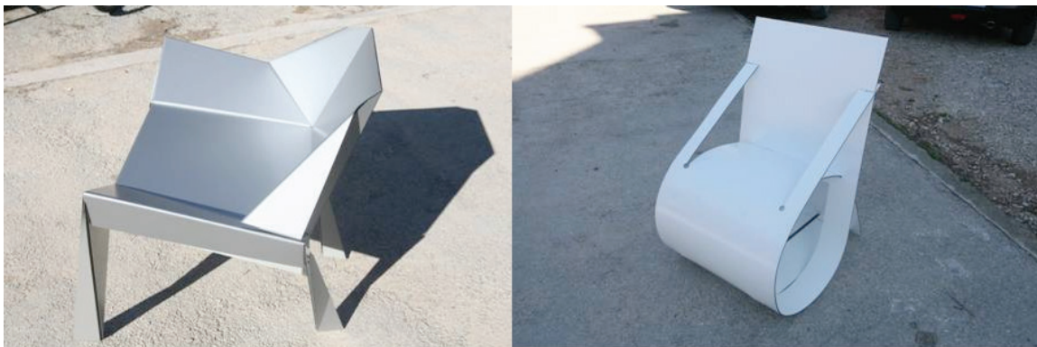
Figure 3. Student project year 2012-13, prototypes, folded and curved composite aluminium panels (X.Tzatha, E.Alexiou, N.Anthouli, A.Chatzimichali / S.Ntzoufras, E.Stathopoulou, M.Teliou)

For the year 2012-13, we used composite aluminium panels for the students' designs. Mainly the techniques of folding and rolling were implemented, as shown in the two following examples of chairs.