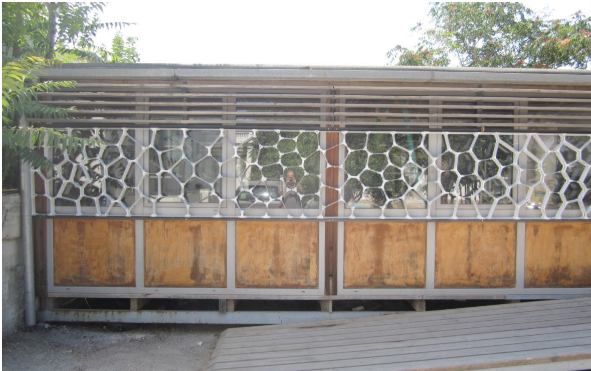
Figure 3. Student project year 2012-13, shading device from composite aluminium panels (S.Ntzoufras, G.Prosoparis, C. Freitas)

This year, for the winter semester the material used was fibre reinforced plastics. That decision led to fluid, double curvature forms for chairs, and a tedious process of making wooden and fibreglass moulds, in order to get to a prototype.