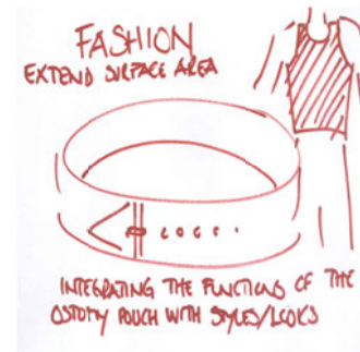
Figure 3. Example solution for control liquid (random)