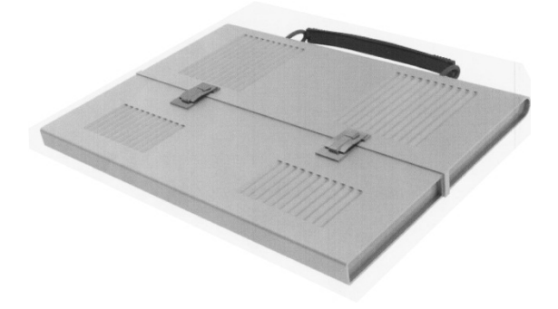
Figure 7. Laptop Computer Carrier

The foundational narrative was about memory. The object was a lunchbox. The trope from the narratives of contemporary design was "hyperbole," or an obvious and intentional exaggeration of an object beyond its normal function and visual values.