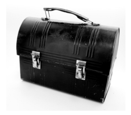
Figure 6. Grandfather's Lunchbox

After Jon had thoroughly explored a variety of new narratives for his design, his final proposal was a thin, lunchbox-influenced, laptop computer carrier as shown in Figure 7.