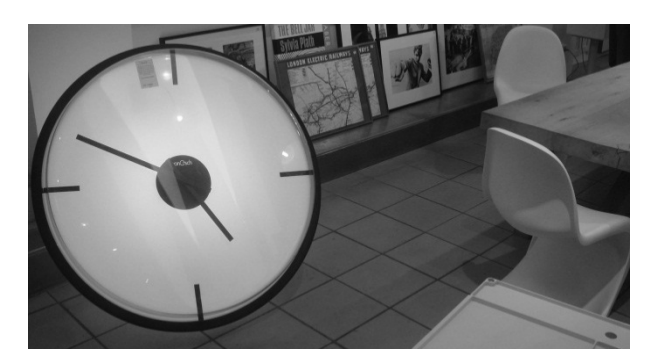
Figure 4. Hyperbole

Antithesis: the juxtaposition of contrasting ideas or objects which ultimately creates a new way of seeing or understanding the seemingly concrete characteristics of an idea or object. Lighting fixtures and cheese graters normally have nothing to do with each other, yet in Figure 3 when the two objects are combined, the perforations are no longer seen as elements used for grating cheese, but rather as diffusers of light.