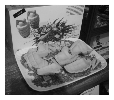
Figure 2. Irony