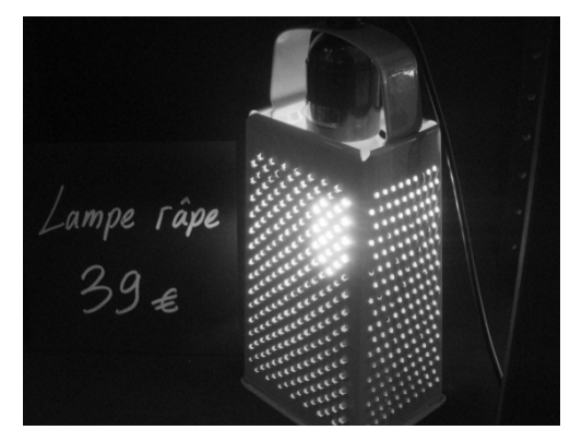
Figure 3. Antithesis

Irony: uses design to convey a meaning that is opposite to the product's literal meaning; it is often associated with humor. The Flower Grenade in Figure 2 is an example of irony because contrary to the inherent destructive nature of a hand grenade, this clay hand grenade promotes growth by spreading seeds after it has "exploded" in a field.