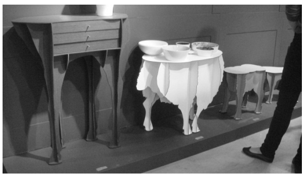
Figure 5. Zoomorphic

Hyperbole: an obvious and intentional exaggeration of an object beyond its normal function and visual values. Figure 4 is an example of hyperbole because the kitchen clock is so large that it doesn't need to be hung on the wall in order to be easily viewed; it can just rest on the floor.