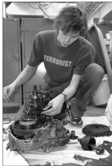
Figure 2. Students presenting engine and gearbox with eagerness (2005 and 2006)