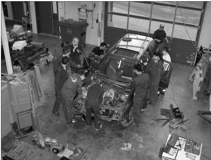
Figure 1. Dismantling the car is quickly done having five groups working on individual parts of the car (2005)

After the final presentation, tools and workshop are cleaned and car wreck is prepared for removal.