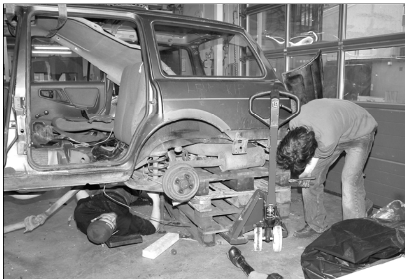
Figure 3. Safety is a challenge when several students are working under and inside the car at the same time (2005)

The workshop staff is involved during the car dissection in order to assist the disassembly and to ensure sufficient EHS. Oil, gas and other chemicals must be treated in a safe manner, and special pads are used to suck up oil spills. It is very important that safety is ensured, when several students are working on top, inside, under and around the car at the same time. EHS instructions must be provided to all students and included in the task description and initial introduction.