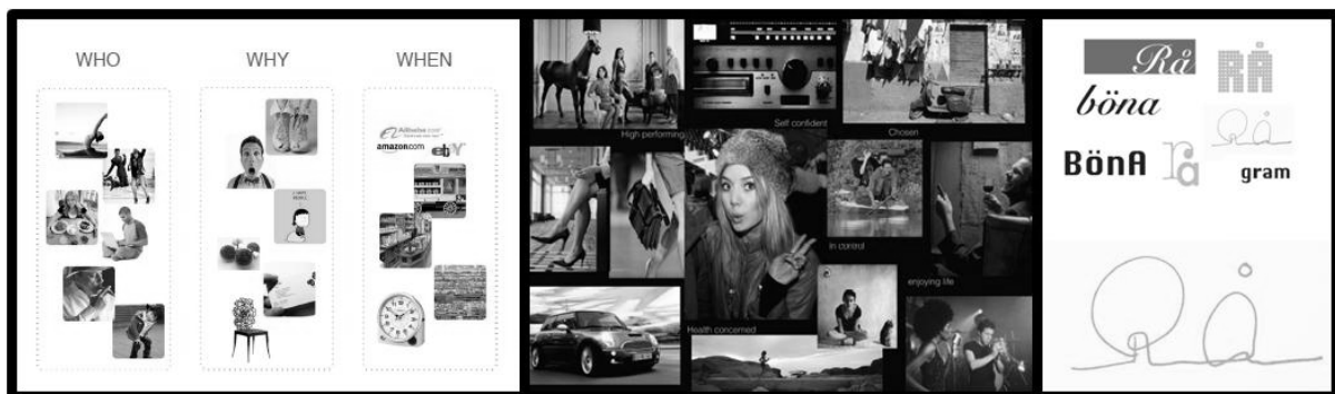
Figure 3. Example brand definition (left, persona description (middle) and logo development (right), the final logo on the bottom

On the basis of the brand analyses and a wider positioning study among the premium chocolate brands, the basic idea for a new brand came up. In defining the brand essence, various verbal and visual methods were used (see Figure 3). The group worked on defining a clear statement of who should eat this specific chocolate, and why and when. The core essence, the aspirational mindset, the interaction with the product package and the emotional function were considered in depth. The brand, named “Rå” (meaning “raw” in English), was particularly targeted for young active adults.