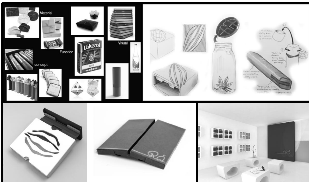
Figure 4. Example of inspiration board (top left), concept sketches (top right), final Rå product (bottom left), and Rå “Pop-Up Store”

The visual analyses of reference products resulted in an innovative package solution (see Figure 4). The intention was to depart from the traditional appearance of package in the premium chocolate category, for instance by avoiding the typical black colour. Instead, the group decided for a scheme of glossy white combined with exotic purple to create a fresh feeling. The connection to the raw material of cocoa, an important link in premium chocolates, was made apparent by using a styled figure of the cocoa bean on the top. The Rå brand name together with the white clean surface is also representing the Scandinavian origin of the brand. In overall, the distinctive package design aims to communicate that the brand is an exciting newcomer in the chocolate category. In addition its prominent visual appearance, the package presents a structure that certainly creates curiosity among users. The two parts structure gives the product a different look when closed, opened and placed in different positions. Since the package is also very functional, it represents the Scandinavian design heritage of the brand and exclusiveness at the same time. To create attention and market the new brand, the group also designed a “pop-up brand store” that appears in selected cities in a surprising manner and stays in the spot for a limited time only. The store and its various extra services are designed in the same style as the package.