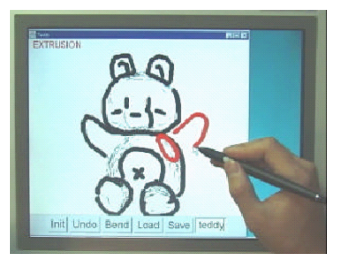
Figure 1. The Teddy Modelling system

A Java implementation was made based on Teddy. The complete prototype can be downloaded from the web at [Verlinden 2002]. Teddy is a powerful yet simple sketch-based 3D modeller proposed by Takeo Igarashi [Igarashi et al. 1999], Figure 1 shows Teddy on a pen-based system. It supports creation and editing functions, including creation, bending, painting, extrusion, and cutting. The basic method to construct 3D polygonal surfaces from a 2D silhouette is by inflating the region surrounded by the silhouette making wide areas fat, and narrow areas thin. This enables fast and simple construction of organic shapes.