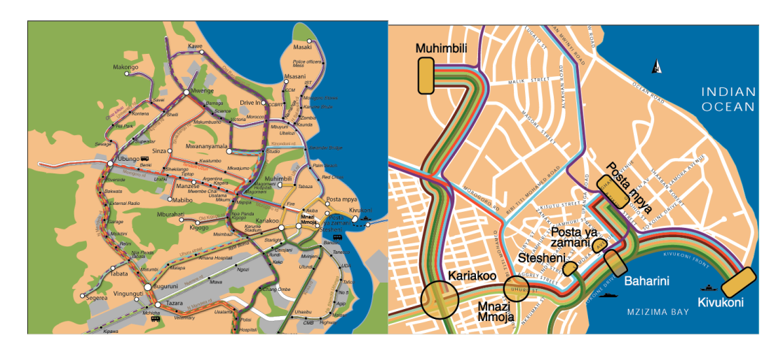
Figure 2. Map of the Dala Dala transport system