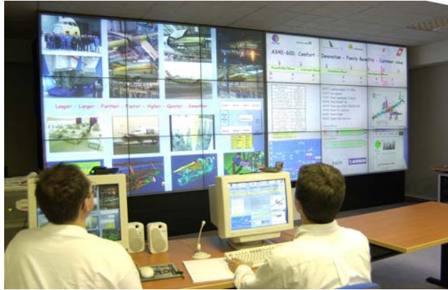
Figure 2 : Development program overview