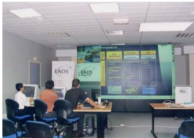
Figure 4: The Interactive Decision Room

In the context of meeting rooms, interaction metaphors and devices with the large area display have been more deeply studied and some facilities are being implemented. This global show-room framework will then be provided or proposed to Airbus development teams (A380, A400-M) as meeting facilities and collective display for Integrated Design Teams.