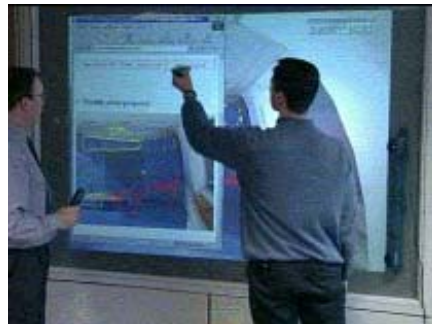
Figure 4: Direct Interaction on the wall (design review)

Given the particularities of the Interactive Decision Room specific interaction solutions have to be considered. For instance, in a classical review configuration, interactions with displayed information can be made from each participant's place ( in a remote location in the room). Laser pointer devices have recently been very popular for remote pointing applications as interaction device for presentation systems [14][15]. However, interacting at a distance from the display surface using laser pointers implies a certain amount of restriction and inconveniences, especially in our context. Various studies [16][17] have clearly stated the inaccuracy of laser pointing devices due to the hand unsteadiness. Filtering might reduce the jitter caused, but it still remains important and proportional to the distance from the screen and the display size (up to 15 meters away and 6 meters wide in our case, which is four times more important than any experiments undertaken). What is more, the incapacity to explicitly select objects using a pointer (in comparison with the mouse click) makes the laser pointer a slow input device (almost twice as long as a touch sensitive system) and inadequate to most of the commercialized application's interfaces where clicking is the natural way of navigating through the GUI. We could therefore not consider using such a device given the uncommon room and display wall proportions, and the diversity of applications used.